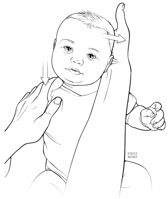
Torticollis stretching tilt for right side