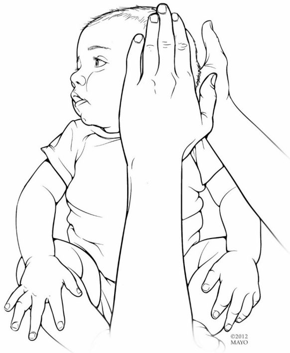
Torticollis stretching and rotation for right side