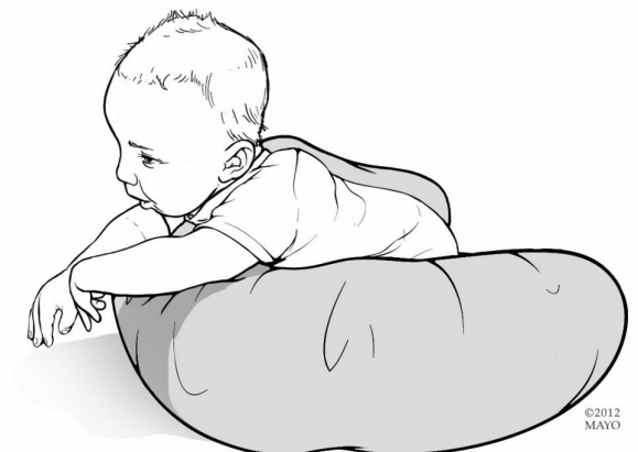
Tummy time on pillow or Boppy®